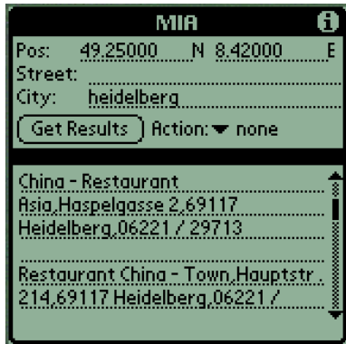
Figure 3: PDA Results

home you tell MIA your interests via its standard web browser interface (Figure 2.1), or with the web browser installed on your PDA. Starting your journey, you select